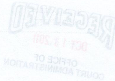
Phil A. Parker County Judge

After submitting the formula grant application on-line, the following Internet submission confirmation number was received #201215820111010. This grant application submission was in accordance with the Commissioners Court Resolution above.